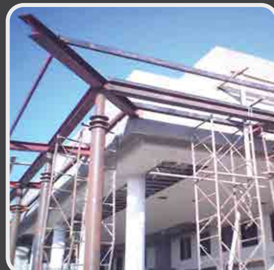
Photo Gallery Pedestrian bridge and vehicles