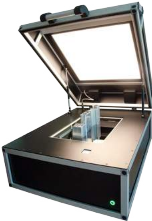
ENGVIEW SCANNER 400

Delemar has a fully equipped location for casting and recycling Aluminium scrap which is produced during the pressing process. The scrap is recycled into billets that are reused. This process eliminates waste and adds cost efficiency. A second casting line was added in 2019 making the monthly production capacity of both lines reach 2400 tons of 99.7% pure ingots.